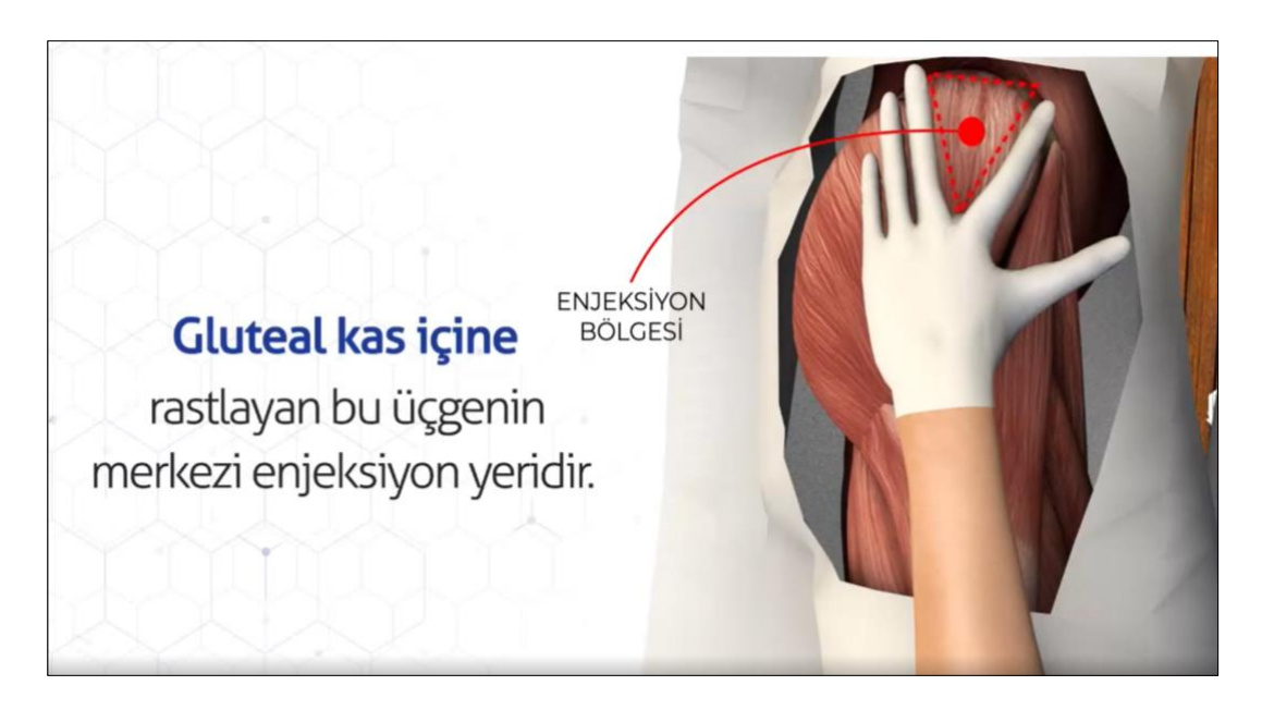
Figure 2. A screenshot from the animation

Gluteal kas için rastlayan bu üçgenin merkezi enjeksiyon yeridir = The center of the triangle is the injection site.