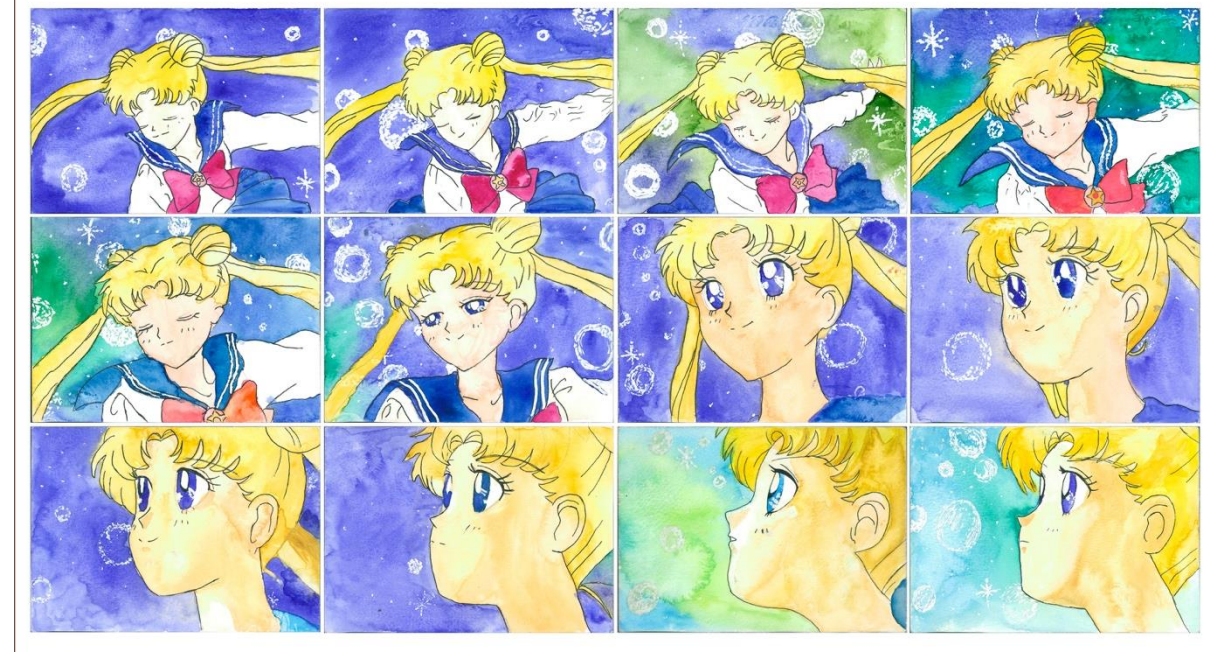
Figure 5. Sailor Moon, by Selen Akdaş (Student animation project).

Figure 4 illustrates a student work. Freshmen students at Visual Communication Design Department who take the course of "Animation Production Techniques" are required to make a flip book animation project in order to understand the first stage of creating a motion picture form. In the first week, the students are shown examples of flip book in a historical framework and they are provided with detailed information for creating alternative flip book methods and they grasp the concept theoretically. In the half-term project, the student began to compress a conversion scene from the main character of the Japanese cartoon series "Sailor Moon" into a series of 96 frames. Pencil and marker pen for coloring are used for the application.