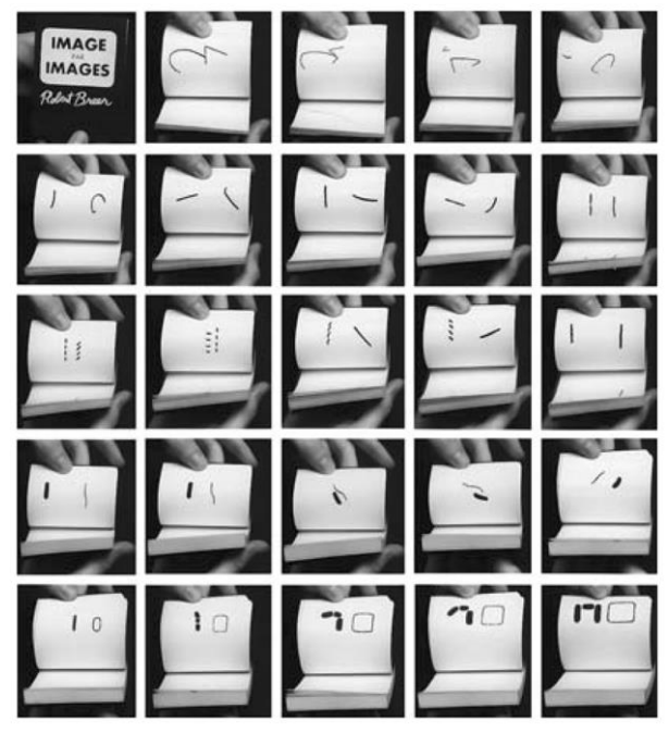
Figure 3. Robert Breer, Image by Images, 1955. Kineograph or flip book. Reprinted from Between The Black . Box and The White Cube. (p. 95), A.V. Uroskie, 2014, Chicago: The University of Chicago Press.

Flipbook animation also have used by filmmakers and artist to create visual illusions. Composed of scores of minimal, abstract ink drawings, each page differing only slightly from the ones following and preceding it, Breer's Image by Images (Figure 3) was the first artist's book to employ the Victorian "kineograph" or "recorder of movement." (Uroskie, 2014, 95).