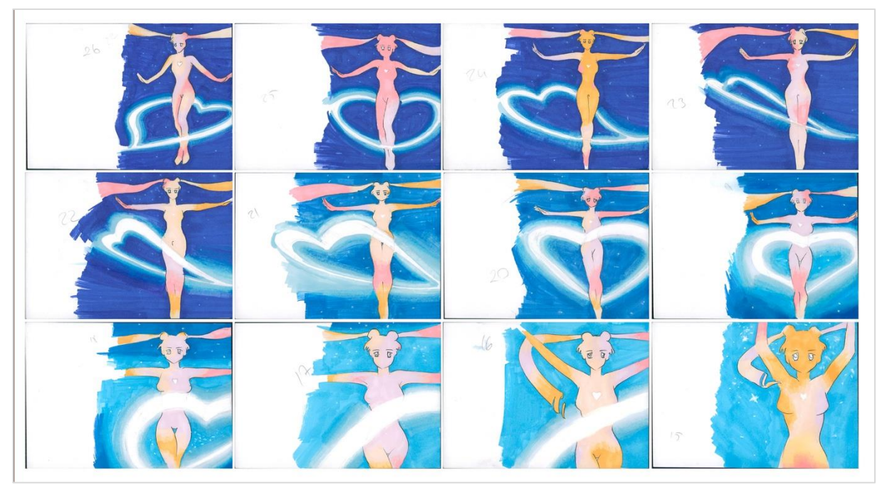
Figure 4. Sailor Moon, by Ela Onat (Student animation project).

Figure 4 illustrates a student work. Freshmen students at Visual Communication Design Department who take the course of "Animation Production Techniques" are required to make a flip book animation project in order to understand the first stage of creating a motion picture form. In the first week, the students are shown examples of flip book in a historical framework and they are provided with detailed information for creating alternative flip book methods and they grasp the concept theoretically. In the half-term project, the student began to compress a conversion scene from the main character of the Japanese cartoon series "Sailor Moon" into a series of 96 frames. Pencil and marker pen for coloring are used for the application.