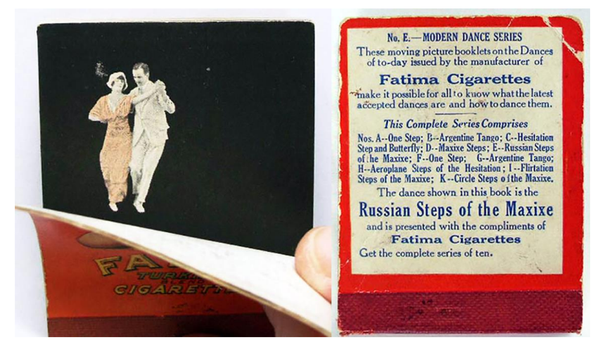
Figure 2. The Maxixe. Liggett & Myers Tobacco Company, Fatima moving picture dance book, 1914. 50 x 65 mm.

Flipbooks were popularized in the early twentieth century by various manufacturers who gave their customers away as free in-pack prizes (Bendazzi, 2016, 15). For instance, The Liggett & Myers Tobacco Company manufactured a Turkish cigarette brand under the name Fatima. The company marketed Fatimas via various platforms such as magazines, radio, and television. Flipbooks were one of their marketing strategies, and they released ten flipbooks with the theme of modern dance in 1914 (Mellby, 2010). This flip book (Figure 2) demonstrated dance figures and instructions gradually. This tiny books which have essence of motion pictures are still producing today.