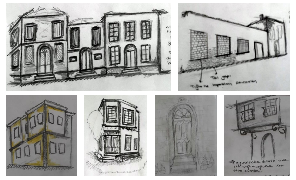
Figure 3. Sketches showing building forms, façade organization and material use in Ayvalık

remarkable, representing the level of wealthy of the owner. Tall doors are decorated with posts, local motives and glass, often elevated with two or three steps. Colorful plastered façades are enriched with flowers while saddle roofs and wooden eaves are preferred at top of the buildings (Figure 3).