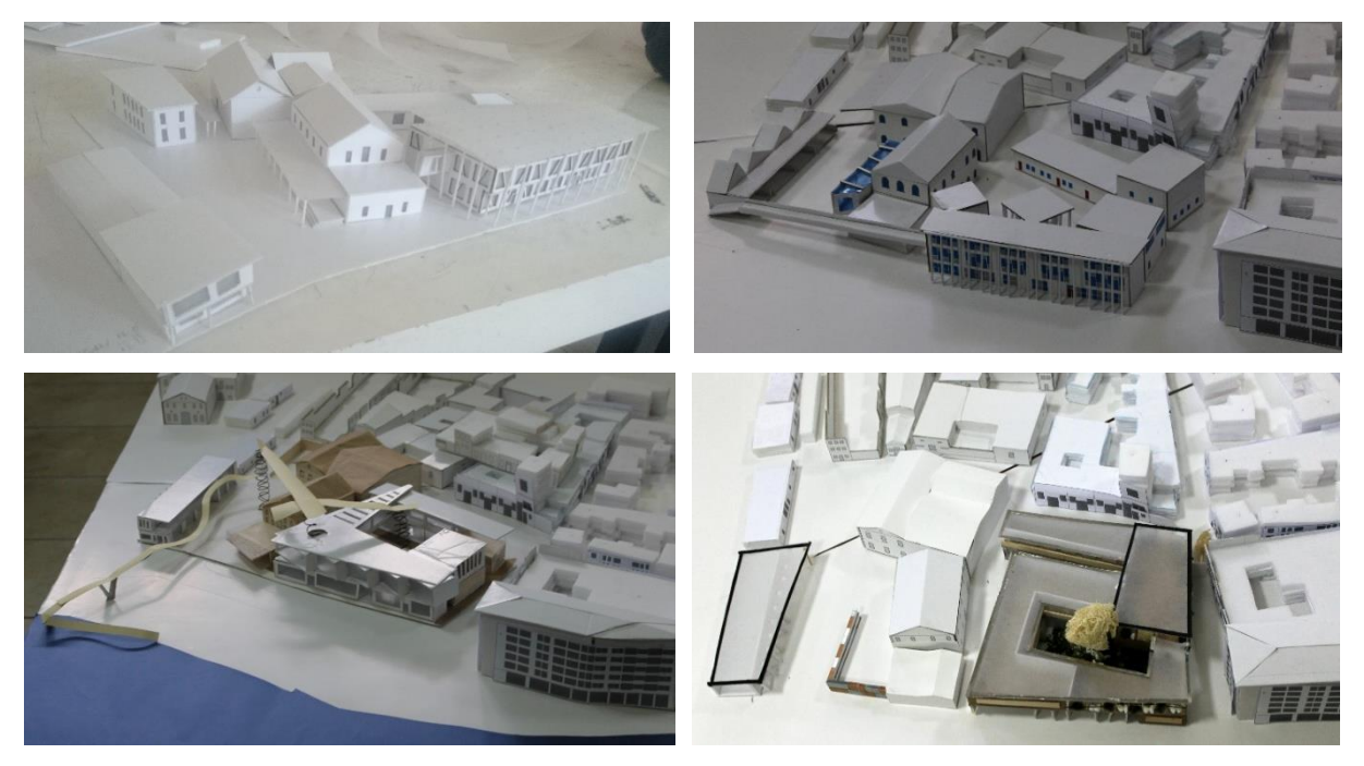
Figure 9. Final jury projects