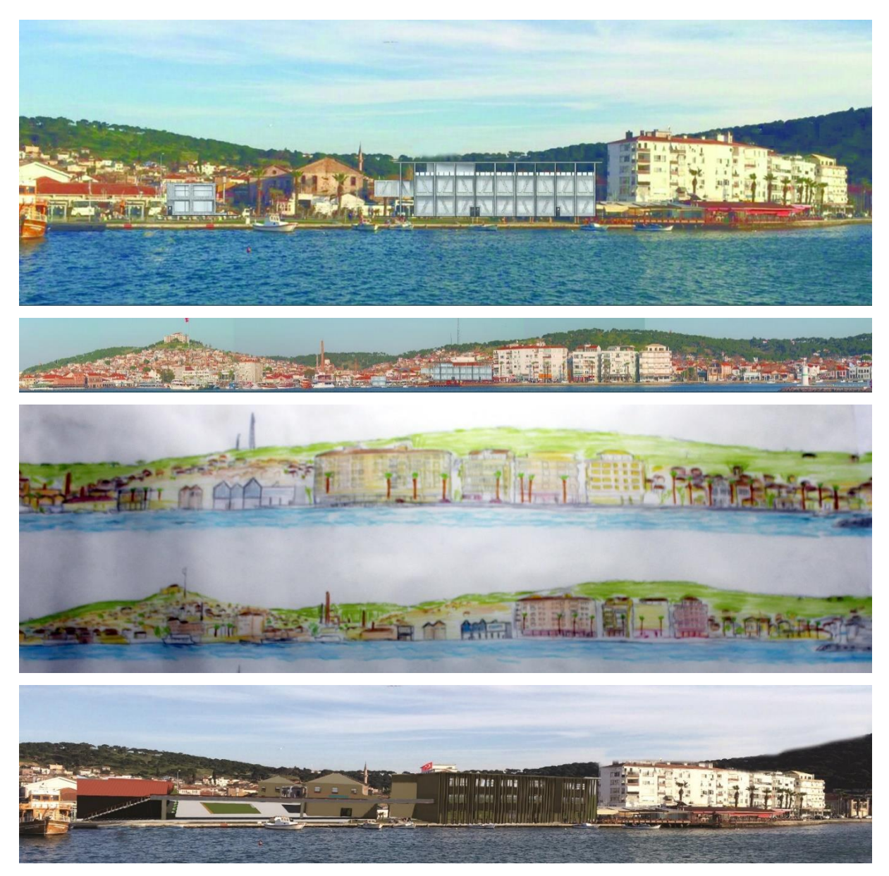
Figure 5. Silhouette studies

Silhouette studies and conceptual model studies gave special importance to the response of the proposals both in urban and historic context. Students proposed lower buildings at north where toasted market and low-rise buildings are located while higher blocks were placed at south where there is a serial of mid-rise buildings (Figure 5).