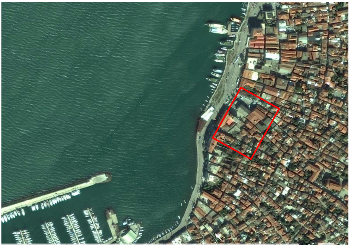
Inc., © CNES 2013, Distribution Astrium Services/Spot Image, all rights reserved, © GeoEye, Inc Kullanici Sözlesmesi 170 m 🚝 Figure 1. Satellite image of the project area (shown in red)

The site of the project is located at the coastline of the Aegean Sea, including five historical buildings with an olive oil factory and a reconstructed soap factory besides toasted sandwich market. Satellite image and silhouette of the site are given in Figures 1 and 2 below.