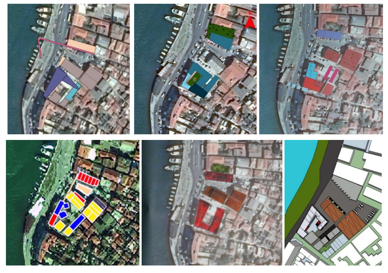
Figure 7. Site plan proposals

On the site plan, an infill study was handled where historic buildings were preserved as they are, new blocks and functions were proposed according to the school program. Most of the groups preferred to preserve the public square and toasted market with renovations. They also proposed to use the historic buildings to be preserved on the site, old olive oil factory building and Migros building, as cultural center of the school complex like exhibition hall and conference hall, while placing administration offices to the historic storage building. The renovated factory building and residential building series were replaced with new blocks and infills. Two groups suggested to link the school buildings and the coast with a pedestrian overpass. Each group presented their projects in 2D and 3D both in digital and physical medium with the near surrounding in order to evaluate the aptness of the design proposals with the environment. Final jury products are presented in Figures 7-9 as follows.