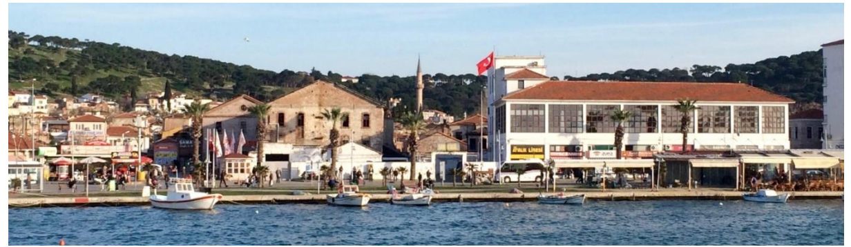
Figure 2. Silhouette of the site from Aegean Sea (from left; toasted sandwich market, olive oil factory, Ayvalık High School) taken by Aydan Balamir (2016)