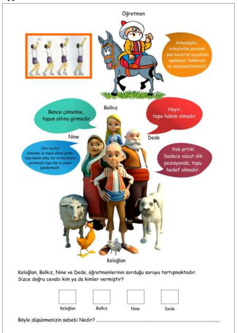
ANNEX-1 Example of concept caricature in the form of working leaf applied in Physical Education