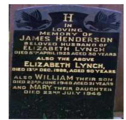
Figure 8. James, B. (2001). (Photographer). Tongland Churchyard - Inscription No.341. Retrieved from <u>http://www.kirkyards.co.uk/tongland/tongland.a</u> <u>sp?offset=340</u>