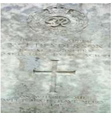
Figure 7. Tongland Churchyard - Inscription No.342.