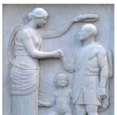
Figure 9. Cyron, M. (2012). (Photographer). Figure 10. Dickranoohee Routh's Tombstone. Grave of Hans von Marées. Retrieved from https://en.wikipedia.org/wiki/Protestant_Ce metery, Rome Copyright 2016 Wikipedia