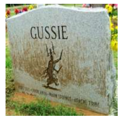
from Finding Hidden Stories in Tombstone Art, by Allison Meier. Retrieved from http://hyperallergic.com/73763/findinghidden-stories-in-tombstone-art/ Copyright 2014 Hyperallergic Media, Inc.

Figure 1.Sitting Bull Monument. Reprinted from Figure 2. Apache Grave. Reprinted Indian Monuments Memorials, Art. Native American Indians. Retrieved from https://in.pinterest.com/pin/161425967868459218/