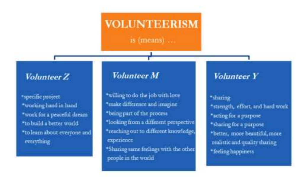
Figure 1. Personal Definitions of the Participants about Volunteerism.

The second general theme was "benefits" which were gained from volunteering experiences and 5 sub themes were determined related to this subject. These were: a. personal development, b. Teamwork, c. active participation and productivity, d. joint sense of purpose, e. social network. (Fig. 2).