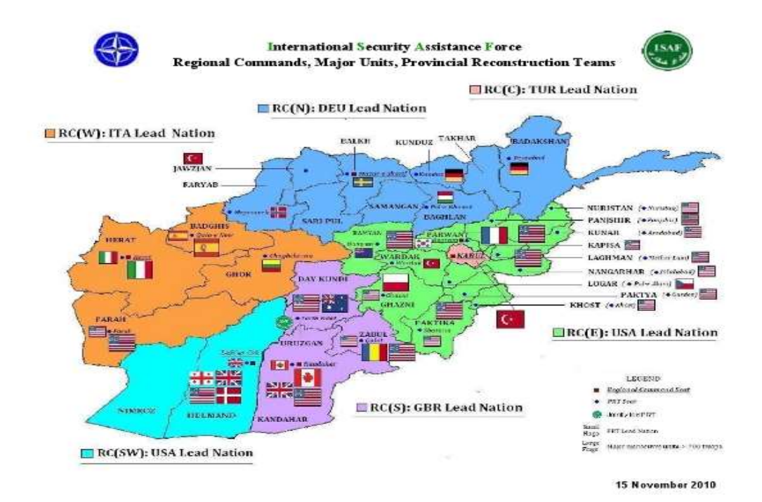
Figure 1: The Regional Lead Nation of ISAF

ISAF was established by UN Security Council Resolution of December 20, 2001, authorized for six months to assist the new Afghan government in order to maintain security. After its establishment, ISAF begun to serve in Kabul, and had 5,000 troops from nineteen countries. ISAF is responsible for providing security in the capital where it conducted routine patrols with local police. However, there was really difficult to maintain the security with new lead nations. In August 2003, the command of the forces changed hands indefinitely to NATO to solve the security problem. So, NATO was the first deployment outside Europe or North America (Perito, 2009, p. 2). Because of its expanding responsibility, ISAF took command of an increasing number of "Provincial Reconstruction Teams (PRTs)" order to sustain security and facilitate reconstruction in provinces. The expansion of ISAF to all regions of the country has brought the total number of PRTs to twenty-seven (See Figure 1).